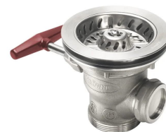
SHORT HANDLE MODEL AVAILABLE: 22-850-S