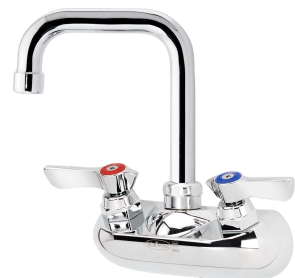
MODEL: 10-435L (FAUCET INCLUDED WITH SINK)